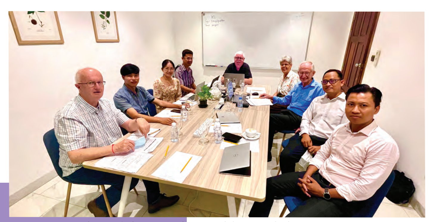
The Board of Directors of Marist Solidarity Cambodia