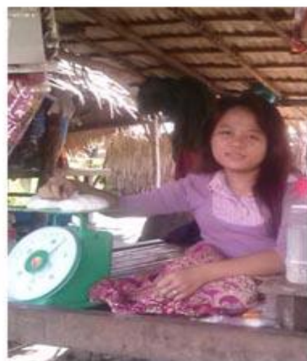
Rat Ravy Polio on both legs Grocery Shop at Home