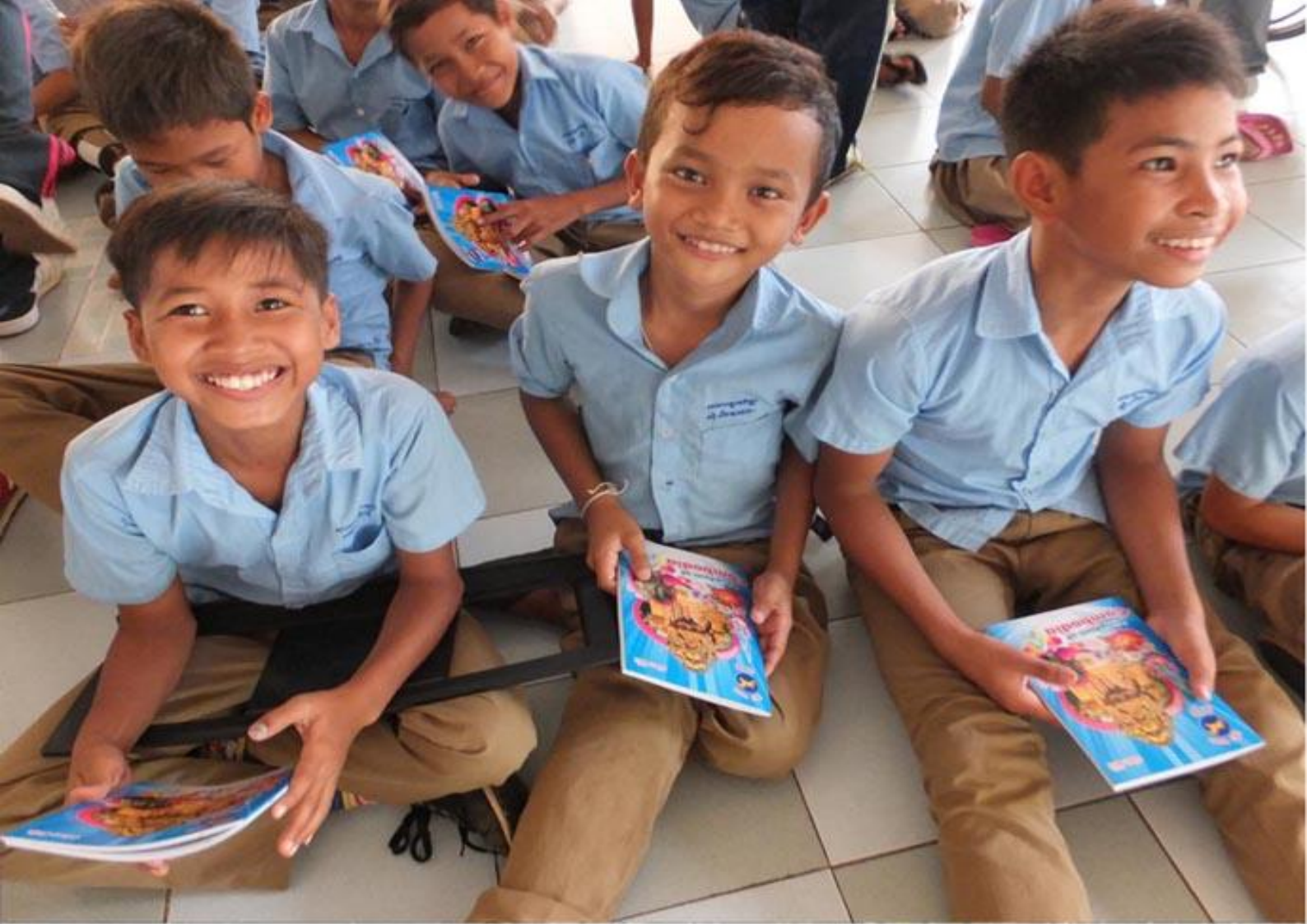
Students at La Valla School