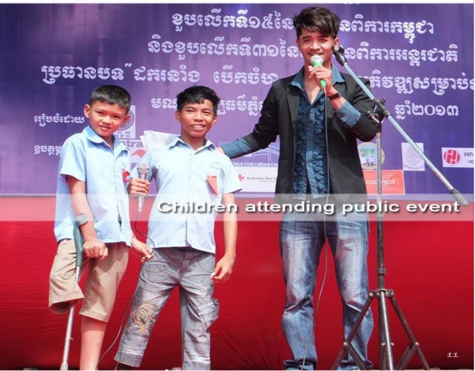
Children attending public event