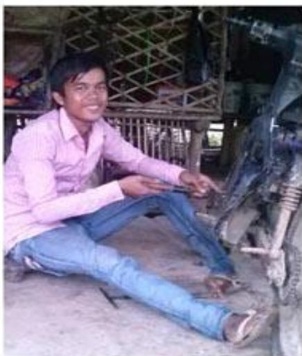
Mi Hokseng Club on left foot Motor Repairing Shop at Home