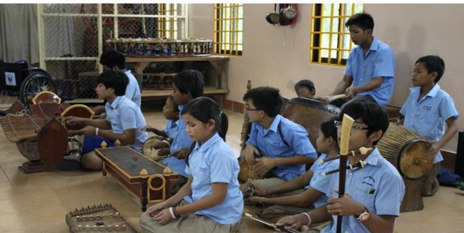
Students are practicing music

A music programme in Classical and Pop Music is also offered to those students who show talent in music. These students perform in the concerts that are put on to thank the visitors to LaValla. This gives them experience in presenting to a "real" audience, and improves their confidence and self esteem. 28 students are studying pop and traditional music, 5 female and 23 male and 6 are from Villa Maria. Five music teachers are involved.