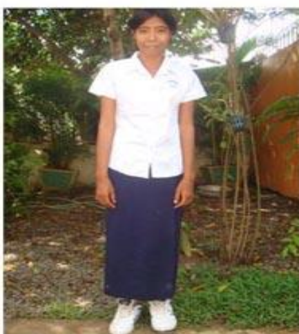
Pov Theavy Epilepsy Sewing at Village Work factory