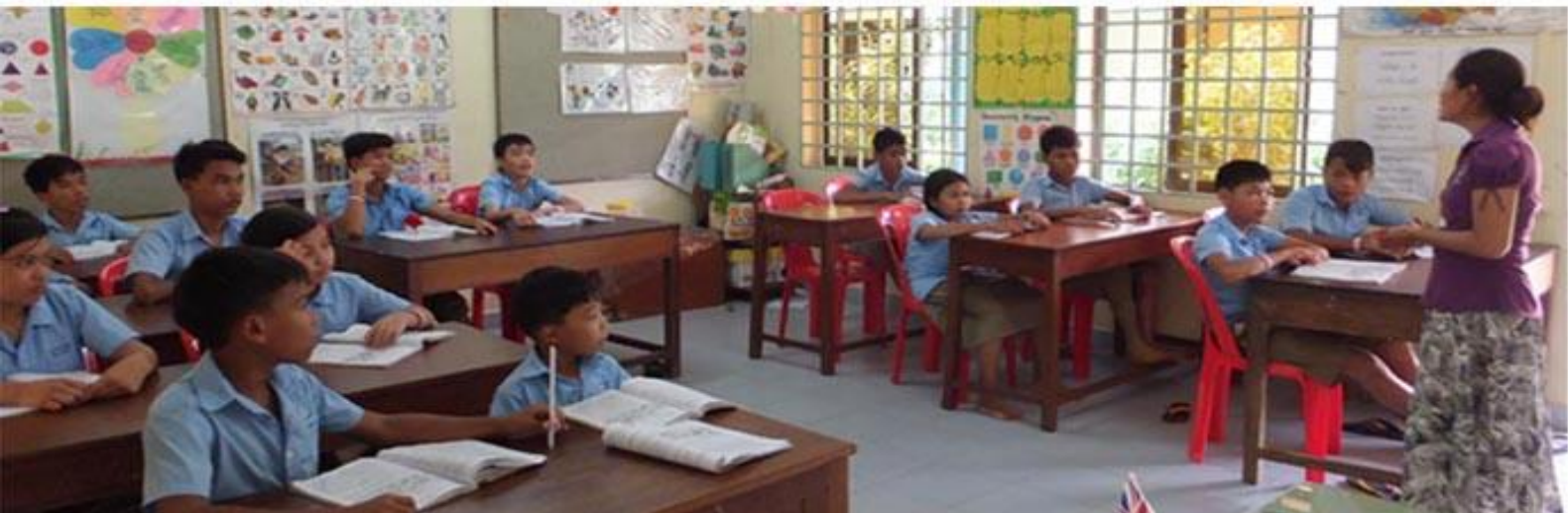
Students in the class