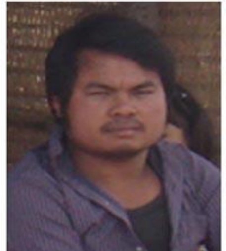
Chory Bory Polio on both legs Electronic Repairing Shop at Home