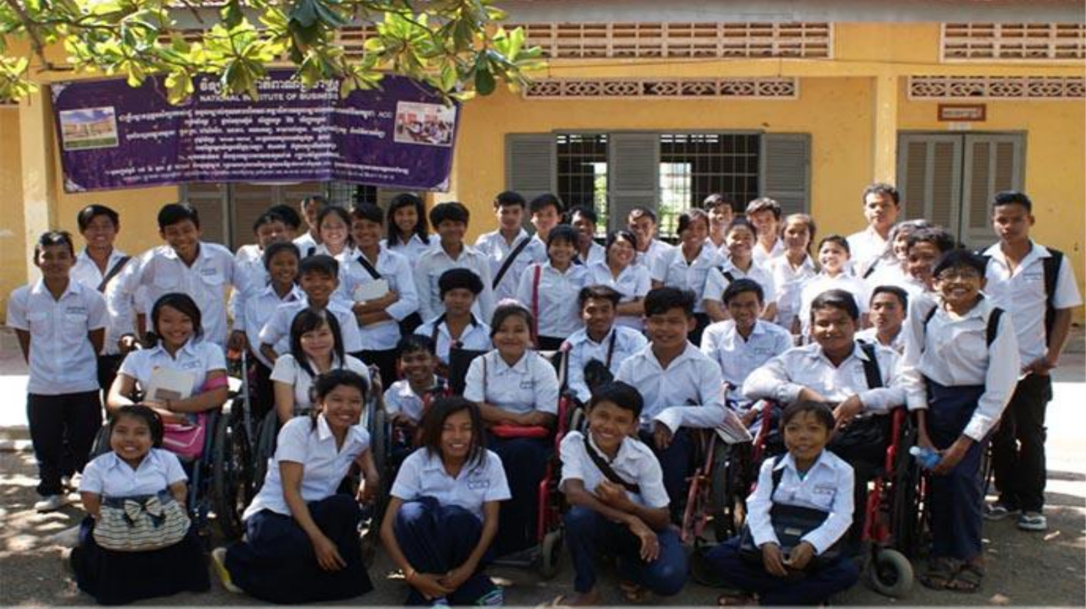
Students at government School