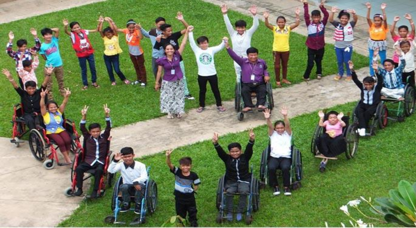
Students at La Valla School