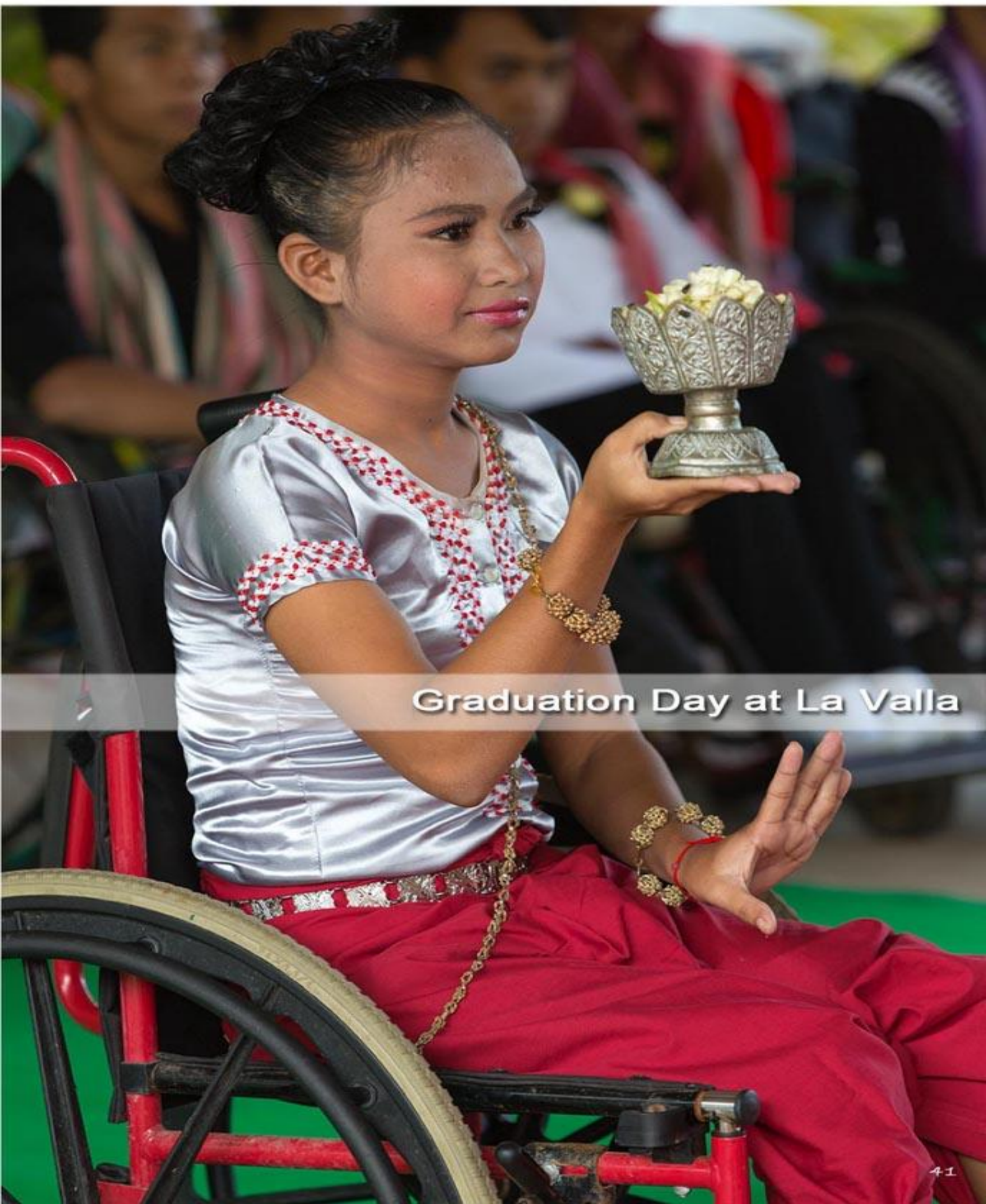
Graduation Day at La Valla