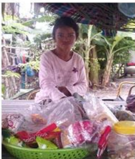
Kiev Loun Polio on both legs Grocery Shop at Home