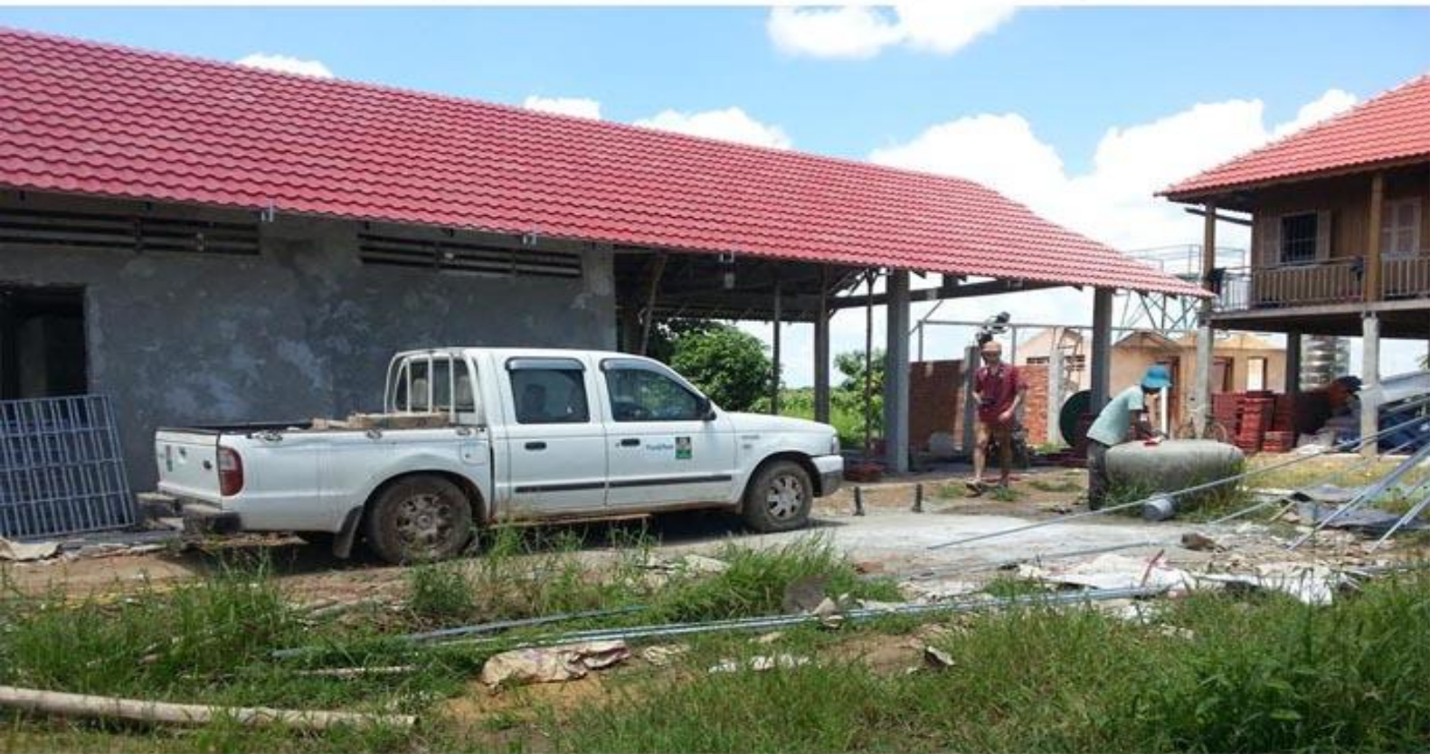
Sa'ang Farm Activities

In Sa'ang farm we grew corn, peanut, sugar cane, and ginger. We have also constructed one building (12m x 6m) for use to storage our crop.