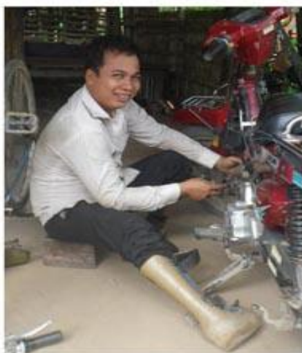
Ee Nang Amputee on right leg Motor Repairing Shop at Home