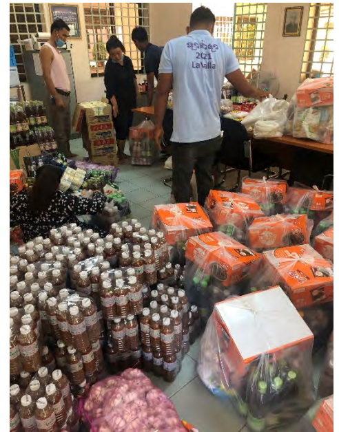
MSC Staff prepare food support packages for families.

We have also been able to install for two families a well for fresh water and toilet systems.