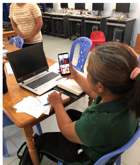
Teacher working with students on-line.