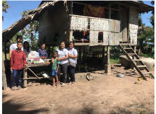
Delivering emergency food supplies to families and phones to students so they can continue lessons with their teachers. .

The LaValla Primary school teachers have been providing lessons each day to those students who can be contacted by phone. Currently we are in the process of providing all of our students with the means to access lessons with their teachers. LaValla staff monitor the work of the students each day.